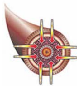
Far Infrared Heating thru Penetration

While conventional irons have long relied on heat provided through shorter wavelengths, this older method insufficiently penetrated hair or the scalp and eliminated chances of healthy styling. The shorter rays heat hair from the outside first, and then conduct heat to the cortex. By heating hair through conduction from the surface, tresses inevitably become frizzy, dry and damaged.